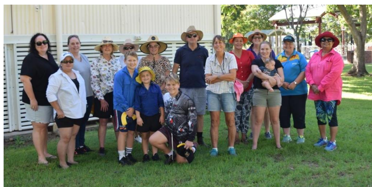
Clean Up Australia Day volunteers in Barcaldine.

Volunteers met at Rob Chandler Park and divided into smaller groups to clean rubbish from the main street, parks, town streets and highways. Due to the work of dedicated community members who clean up during the entire year, the town was very tidy.