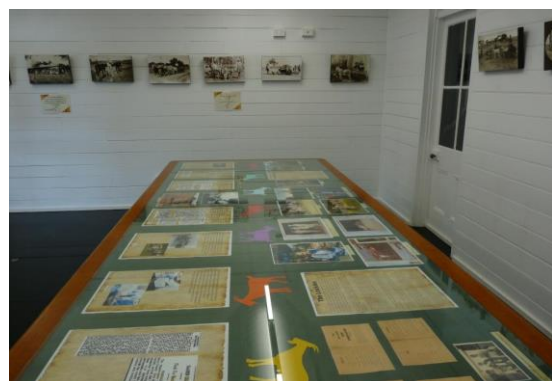
Take the time to visit the Goat Display at the Barcaldine Visitors Information Centre.

Any queries please do not hesitate to contact Council's Local Laws Officer on 07 4651 5600.