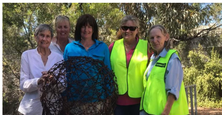
Clean Up Australia Day volunteers in Muttaborra.

Thank you to the wonderful volunteers that cleaned up around the museums in Muttaborra on Sunday morning. The area now looks much tidier and we have received some great feedback already. Refreshments were then served afterwards at the Muttaborra Shop & Fuel.