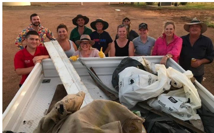
Clean Up Australia Day volunteers in Aramac.

Although it was a very hot Saturday afternoon, it was a successful event and a number of eager volunteers attended the recent Clean up Australia Day, followed by a BBQ dinner at the Aramac Recreation and Camping Ground. 17 bags of rubbish was collected in total.