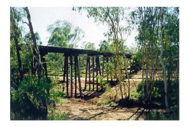
Plate 2 – 'Alpha' River Height Flood Warning Station