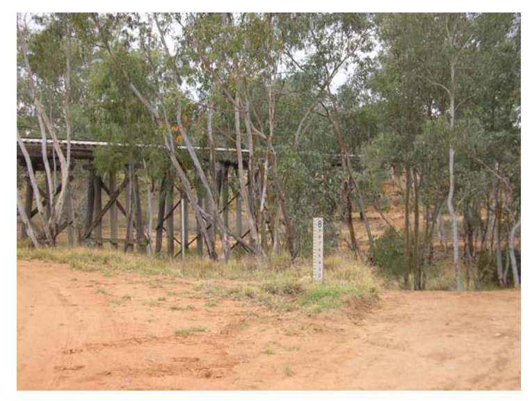
Plate 3 – 'Alpha' River Height Flood Warning Station