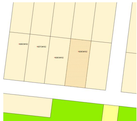
(82-94 Lord Street)